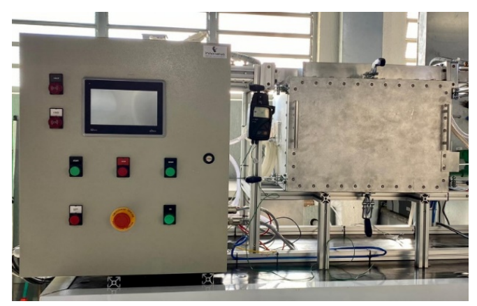
Figure 1. Prototype for batch process in the microwave oven.

containing a resonant cavity of 50 cm in length, 30 cm in height, and 36 cm in width, a power control panel, and an infrared sensor (Omega OSAT Series) coupled in its cavity. The equipment demands 220 AC to 13.3 A, and its nominal power is 2500 W.